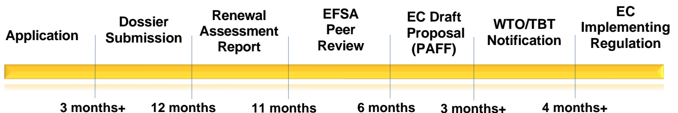
Figure 1: Schematic overview of the EU reevaluation process, timelines are indicative as outlined in Regulation (EC) No. 1107/2009. Steps can take longer than indicated.

For information on specific active ingredients, please consult the EFSA website 4 (then click on the “Pesticide Dossier” tab) or contact the companies that are supporting the active ingredient through the renewal process by contacting croplife@croplife.org .