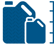
Suitable, easy-to-handle container size