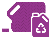
Proper disposal of empty product containers