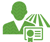
By licensed professional applicators